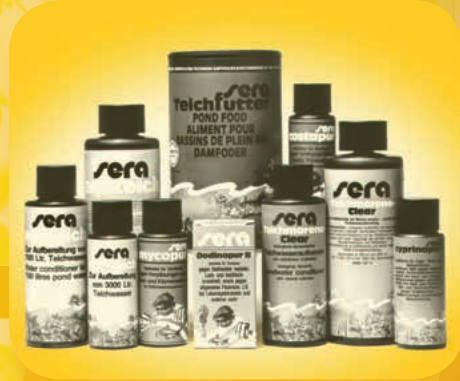
First pond range