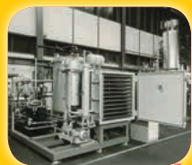
Catching live food

The calendar for this year contains the most beautiful images from the sera calendars from the 1980s, 1990s and 2000s. As in the previous years, the sera Facebook aficionados also this time voted which twelve images should appear in the anniversary calendar.