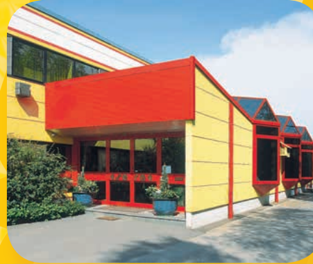
Old administration building

An anniversary is a nice cause for pausing and looking back on what has been achieved so far. The company sera was founded in 1970 by Josef Ravnak with the aim to achieve animal keeping as naturally as possible. Everything began with an innovation: by means of the so-called freeze drying process, food organisms for the first time could be preserved while optimally retaining their nutrients and vitamins. The first food types for aquarium care, such as sera Vipran flake food, which still is among the classics today, followed quickly. Subsequently, there were constant additions and optimizations to the product range according to the philosophy of the company. The marine aquarium, pond and terrarium care segments followed, as did addition of high quality care and technical equipment items to the product range (see timeline). Today, sera is an enterprise with over 200 employees worldwide and a full product range with approximately 4,000 items for aquariums, terrariums and ponds.