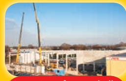
Erection of a new hall, Introduction of technical items to create a full range