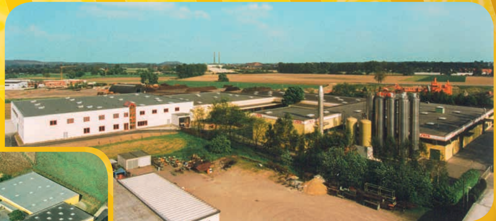
Company premises in the 1990s