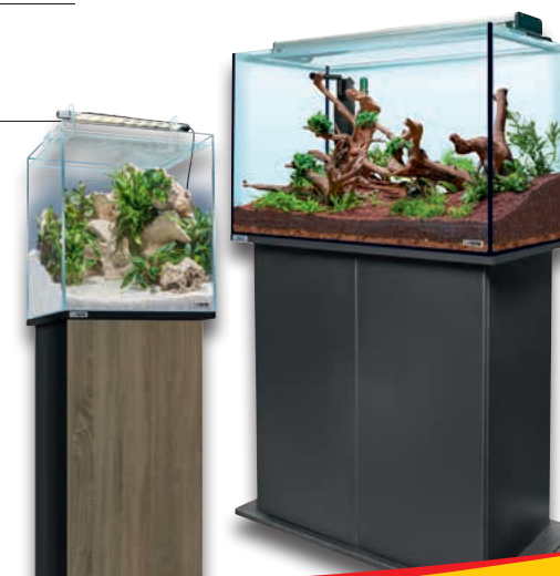
AquaTanks & Scaper Cubes Modern design aquariums for individual configuration

A well structured aquarium is not only beautiful to look at, but at the same times forms an appropriate habitat for smaller and bigger living beings. Shrimps, in particular, do well in this Scaper Cube. Natural decoration such as rocks and roots provide suitable hideaways.